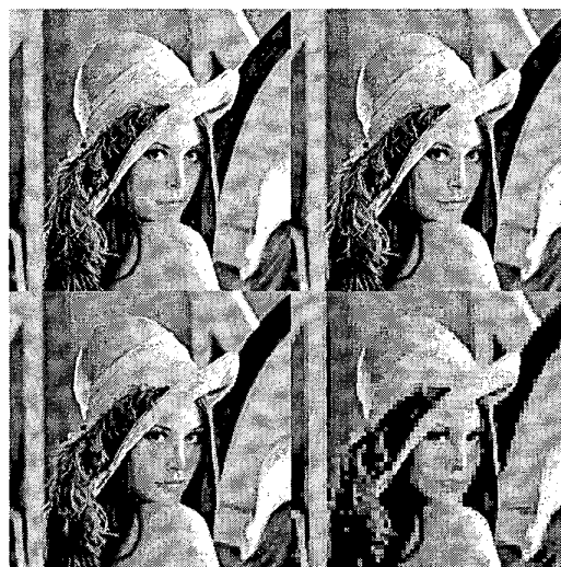
Fig. 3. This figure shows the relation between the distortion due to data hiding and the hiding capacity under the JPEG compression attack with the default quantization matrix. The top left image is the original. The top right image is distorted up to the JND threshold (the hiding capacity is 1310 pixels). The bottom left image is perceptibly distorted (up to 3 times the JND threshold and its capacity is 9670 pixels). The bottom right image is severely distorted (up to 20 times JND threshold and its capacity is 15000 pixels).